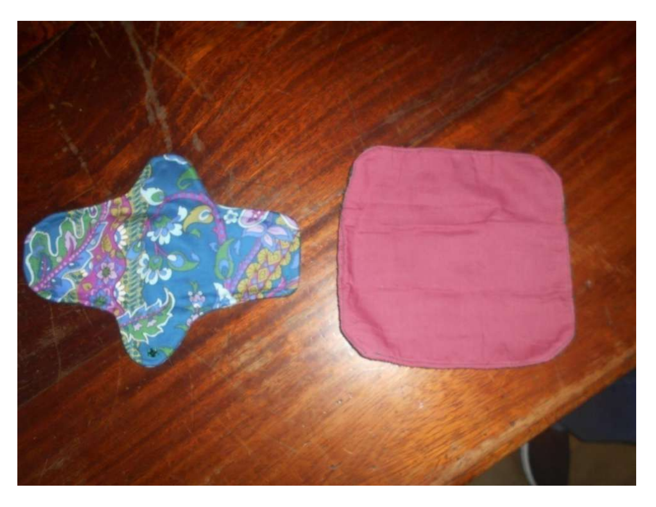
The samples of the sanitary towels we make.