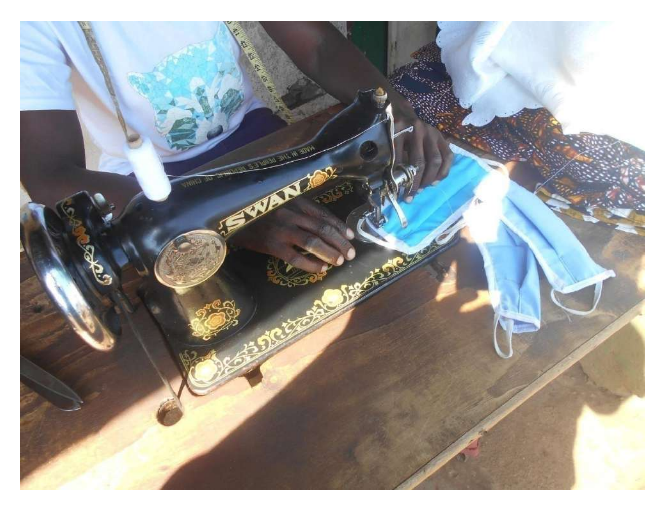
The single mother is making the masks for further deliveries at one of our sites.